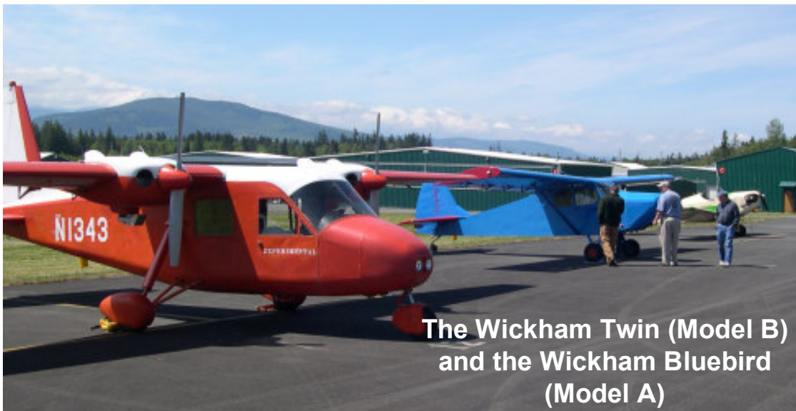
The Wickham Twin (Model B) and the Wickham Bluebird (Model A)